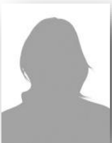
Vacancy Parish Clerk