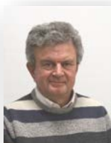
Rex Exon Bradwell Village