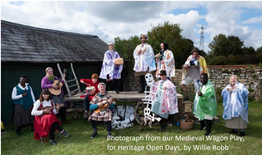
Photograph from our Medieval Wagon Play, for Heritage Open Days, by Willie Robb

Finally, a huge thank you to our wonderful volunteers for their continued support!