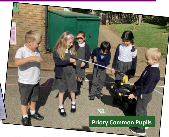
Priory Common Pupils

For further information about Bradwell Parish Council please visit our website: www.bradwell-pc.gov.uk