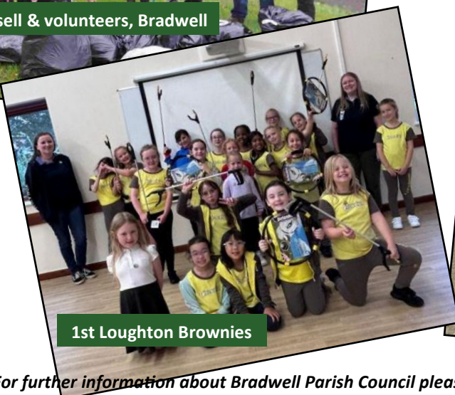
1st Loughton Brownies