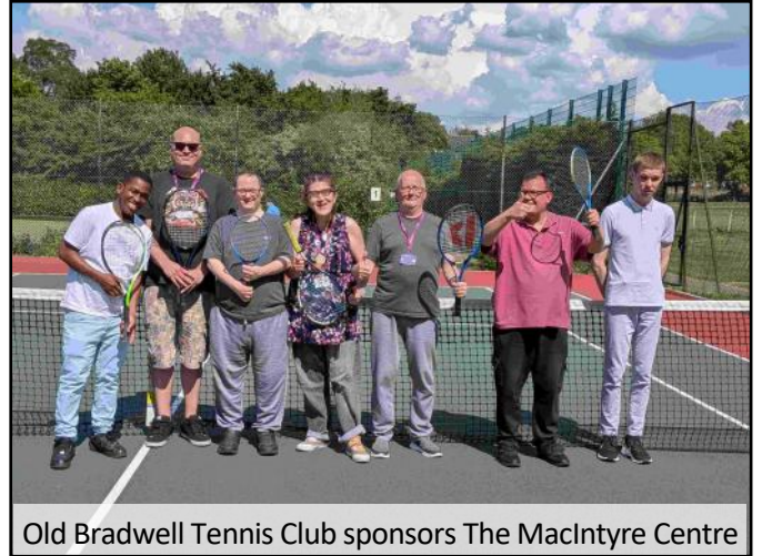
Old Bradwell Tennis Club sponsors The MacIntyre Centre