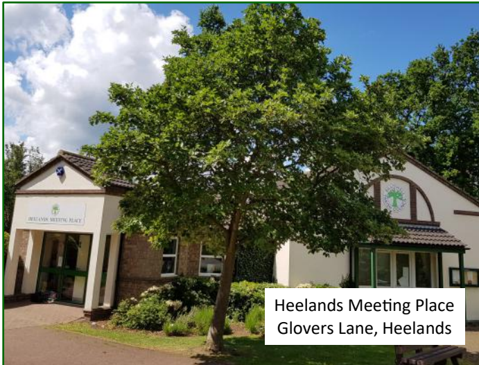
Heelands Meeting Place Glovers Lane, Heelands

For more information on hiring either hall please visit the Parish Council website. The hire charges can be found on our website. T: 01908 321285 | E: admin@bradwell-pc.gov.uk or contact the Assistant to the Clerk.