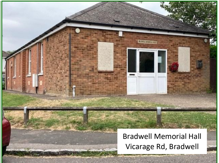
Bradwell Memorial Hall Vicarage Rd, Bradwell