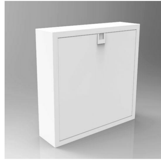
Detail 1: Example of wall-mounted cabinet for heating manifolds.