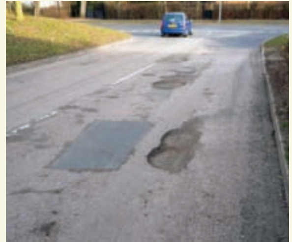
Potholes in the road were the first infrastructure complaint. We have been continually pressing for their repair, and several have been.